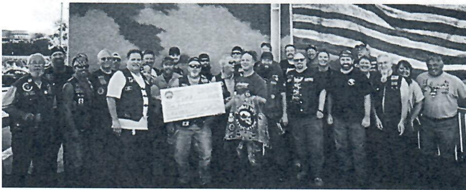
In July, the riders hosted 45 CVMA members at the post. $500 was donated to the IGYSIX fund. The ISYSIX is active in supporting awareness of veteran suicides.