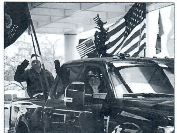
To close out the year, the Rider's "float" participated in a parade at the Minneapolis VA hospital.