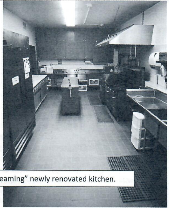
The "gleaming" newly renovated kitchen.