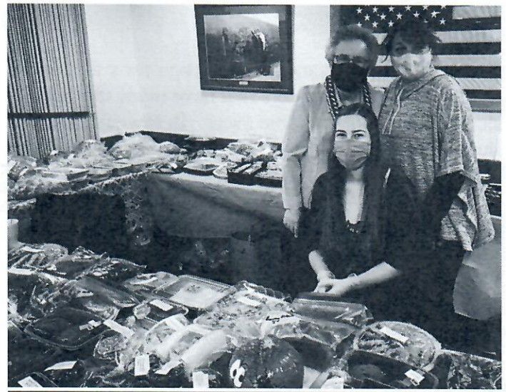
Some of the great volunteers at the successful Craft and Bake Sale in October!