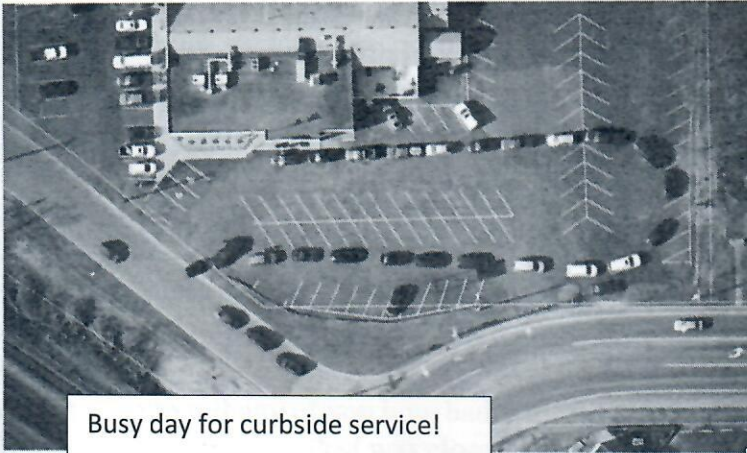
Busy day for curbside service!

Despite 2020 being a rough year, there were good times too!