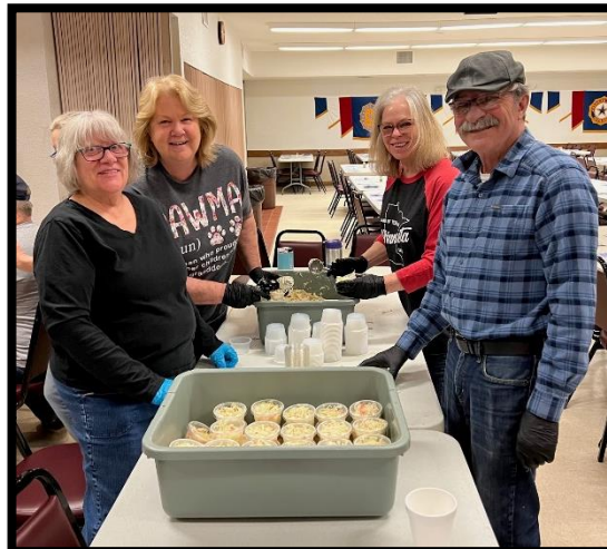
Big Friday night crowds kept the Friday morning coleslaw crew on their toes preparing for the evening meal.