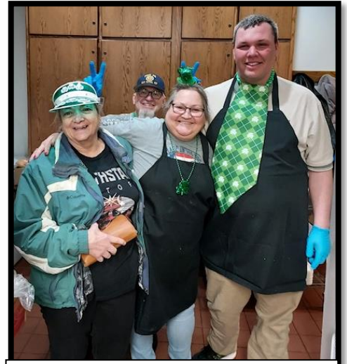
This Irish group appeared to having a good time at the fish fry!