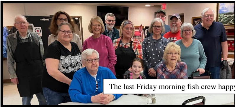
The last Friday morning fish crew happy to be done!